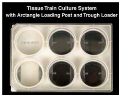
Figure 5. Tissue Train culture plate with nylon mesh anchors, Trough Loader, and Arctangle Loading post.